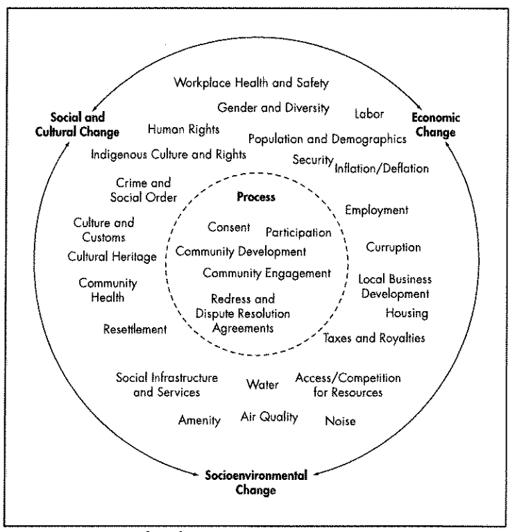
Figure 17.1-2 Examples of community issues in mining

such as those at Marinduque in the Philippines and Minahasa in Indonesia, for example. Both of these cases attracted significant international attention.