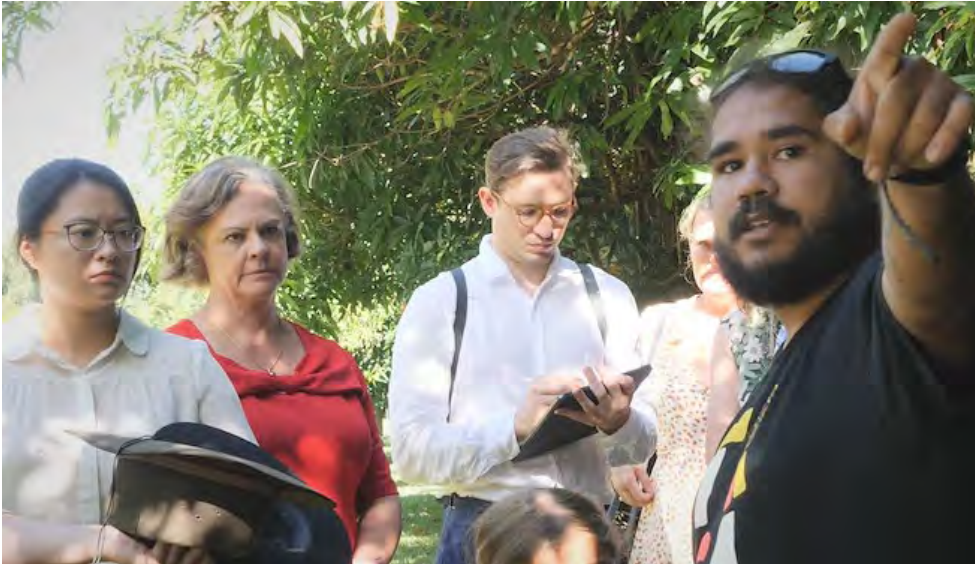
Figure 5 Land Court of Queensland taking evidence on-Country 57

Most of the issues considered were under the broad topics of the Bimblebox Nature Refuge (direct impacts), climate change (indirect impacts), economic and social benefits, and human rights. It is the climate change and human rights arguments that are examined in the following sections.