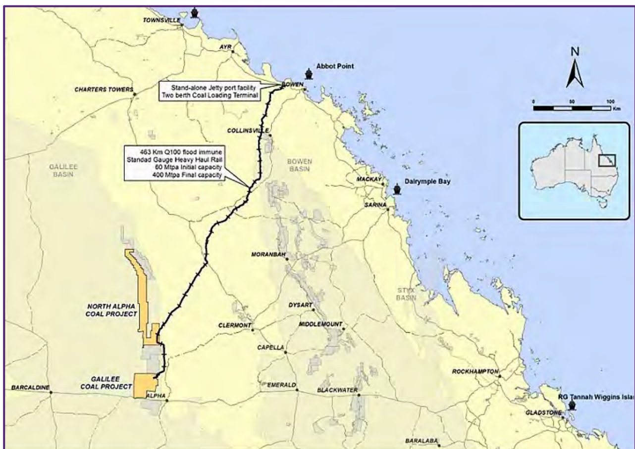
Figure 2 Map from EIS showing proposed railway route and port at Abbot Point

Waratah Coal’s mining lease and environmental applications were ultimately released for public consultation in December 2019. During the 2019-2020 notification period, 22 objections to the mining lease and 16 to the environmental authority were received. Some objections were withdrawn, leaving 31 objections (see Appendix A for a timeline of events leading up to the case).