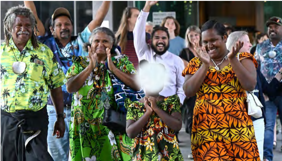
Figure 6 Indigenous objectors celebrate on learning of the Land Court's decision 73

arguments over carbon-intensive developments in Australia. In this case, the nexus between the public interest including future generations and the environmental threats from climate change is carefully and clearly established. Although this is a decision on the facts, and not necessarily a binding precedent, many of its findings and arguments will be of significance to broader environmental and mining jurisprudence.