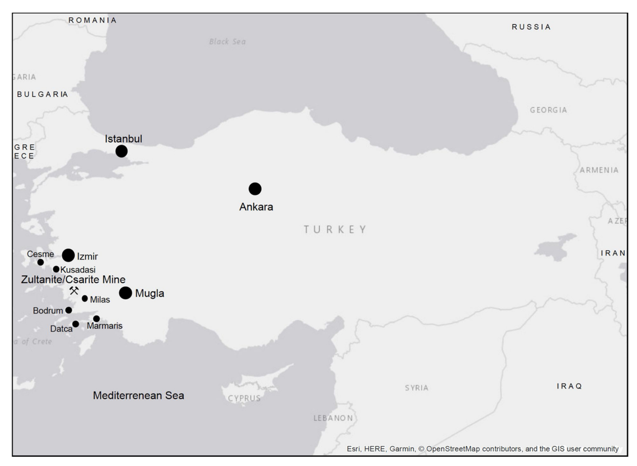
Fig. 2. Location of the Zultanite/Csarite Mine in Turkey, nearby touristic areas, and major cities.

However, this partnership ended in 2012 (Schorr, 2013), and MML marketed the gemstone under the name of Turkish diaspore until it renamed it as Csarite in 2014.